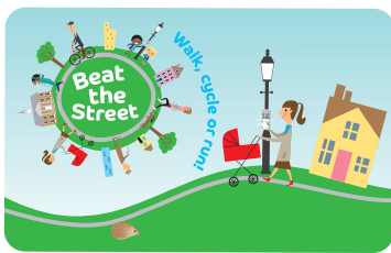
Beat the Street card

Top school teams will win hundreds of pounds worth of vouchers. The size of your school doesn't matter, as there are also prizes for teams reaching the highest average number of points. Individuals can also win Lucky Spot prizes, including vouchers, cuddly toys and Beat the Street goodies.