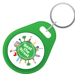
Beat the Street fob