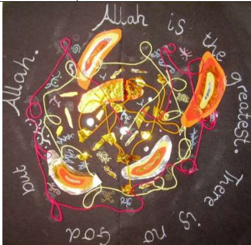
This artwork by a ten year old Muslim student expresses beliefs about God / Allah without drawing an image of God, which Muslims reject.

Wolverhampton Religious Education: Support for Schools from SACRE